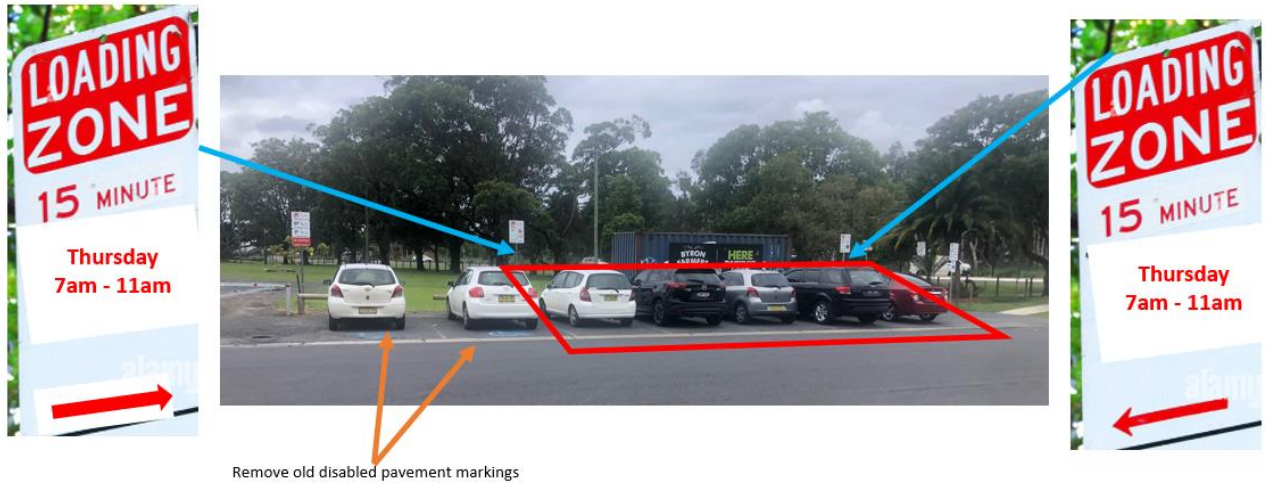
Image 1 – Street View - Red polygon shows 5 carparking bay proposed to be dedicated to the Byron Farmers Market Inc during market hours