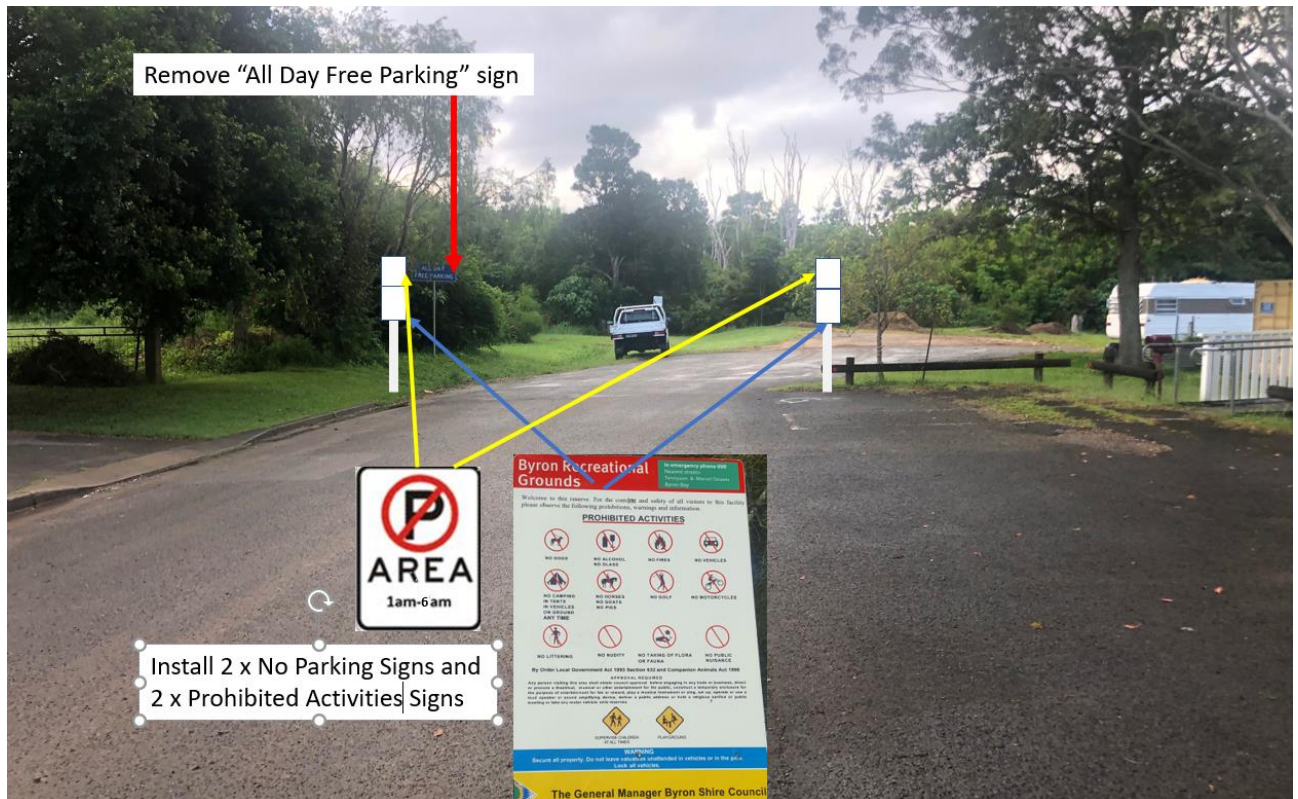
Figure 2 - Proposed signage to address illegal camping