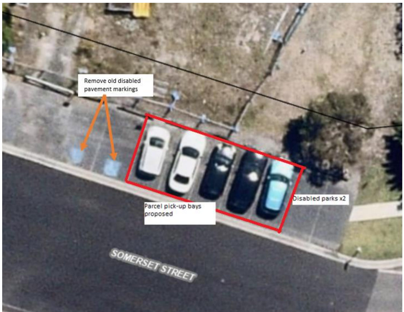
Image 2 - Aerial View - Red polygon shows 5 carparking bay proposed to be dedicated to the Byron Farmers Market Inc during market hours