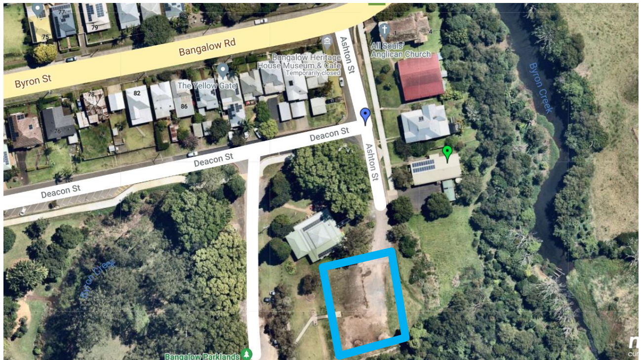
Figure 1 - Approximate location of illegal camping

The following signage recommendations (refer Figure 2) are proposed to deter people from illegal camping and to assist Council's Enforcement Team in effectively carrying out their duties: